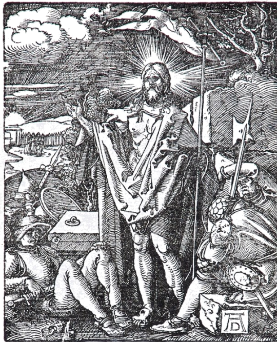
Albrecht Durer, Woodcut, The Resurrection (The Small Passion), c. 1510